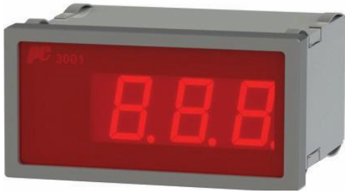
pe3001, front view