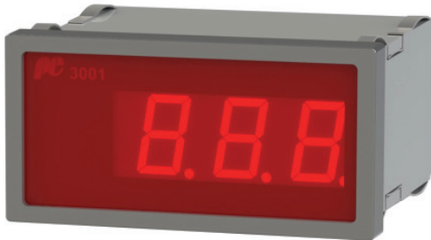
pe3001, front view